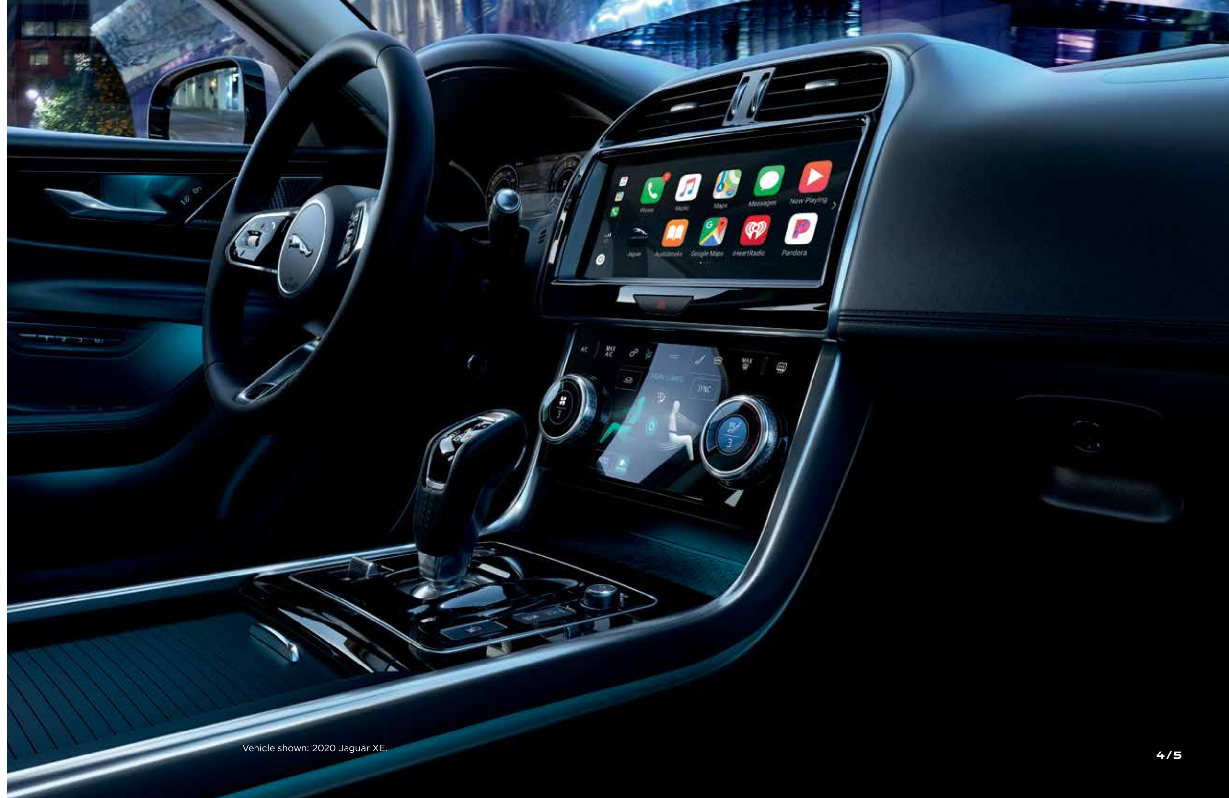
Vehicle shown: 2020 Jaguar XE.