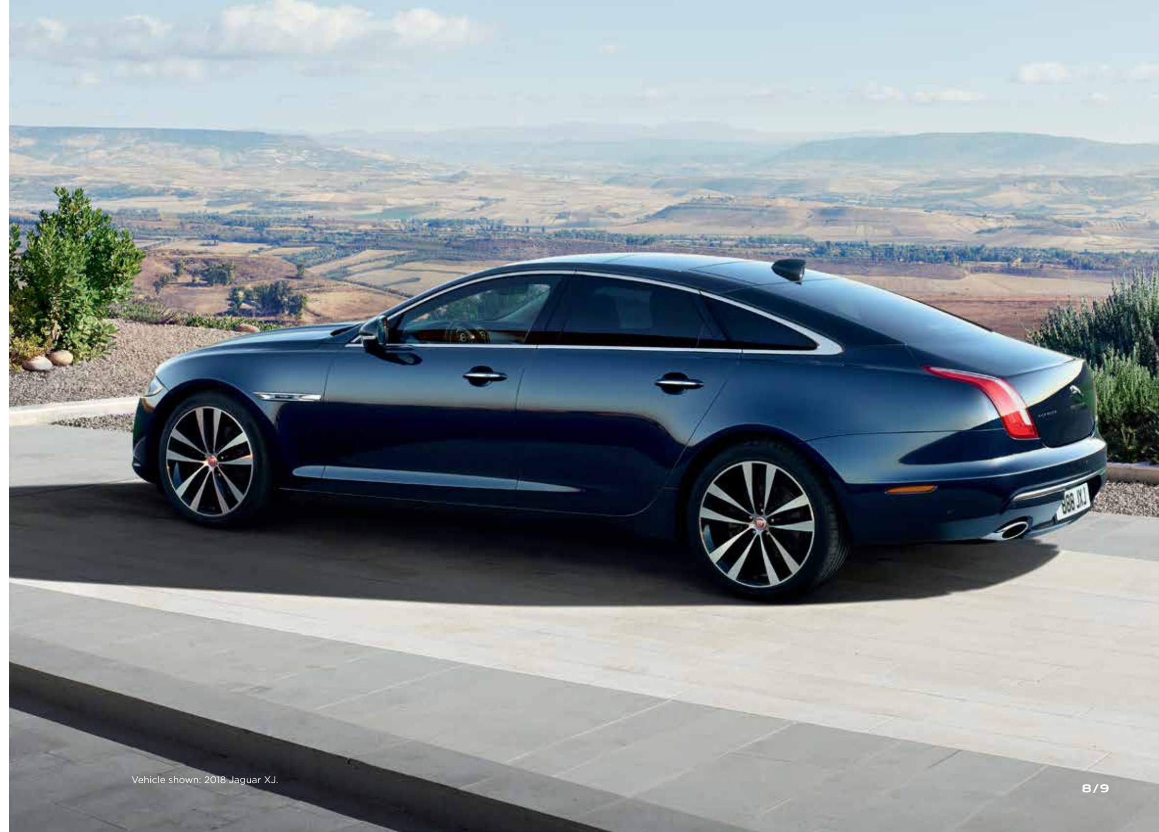
Vehicle shown: 2018 Jaguar XJ.