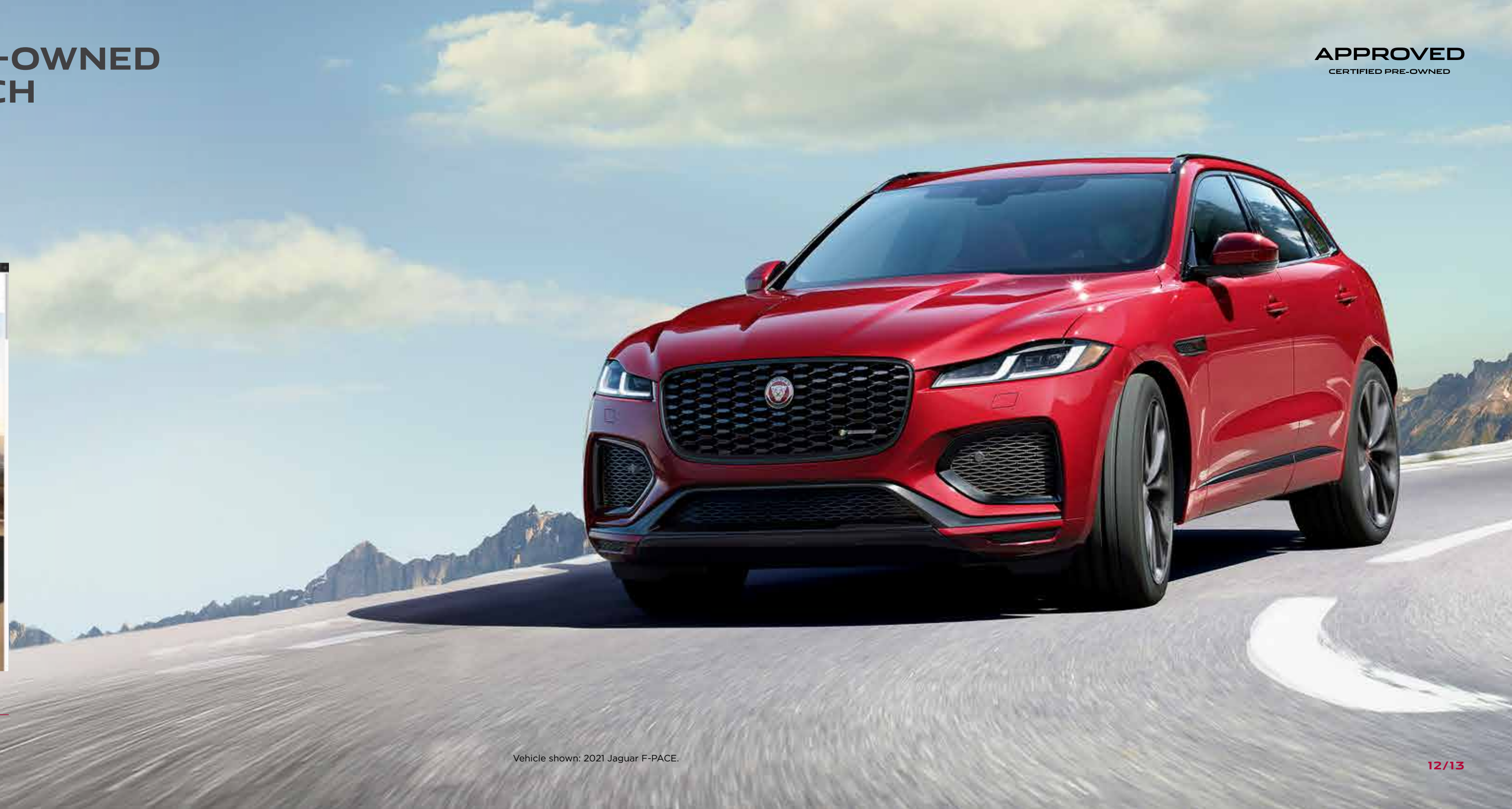
Vehicle shown: 2021 Jaguar F-PACE.