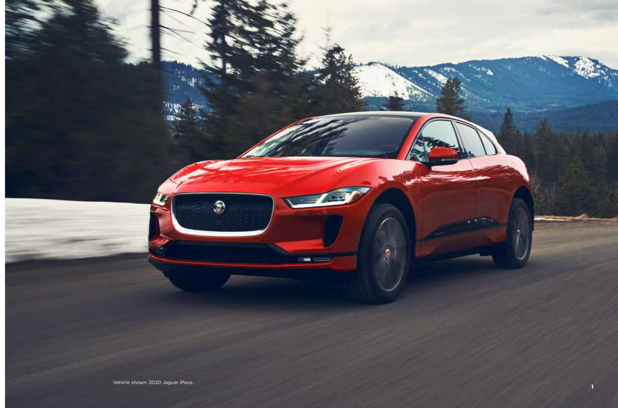
Vehicle shown: 2020 Jaguar iPace.